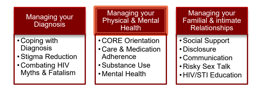
Figure 2: HIV Self Care

To further understand our participants' transnational lives, we incorporated a migration interview as part of our intervention. The migration interview helped to inform our understanding of our participants' connections to Mexico. Specifically, why and under what conditions they decided to migrate; what their migration journey entailed; how they had maintained connections to Mexico and in what ways; and how they incorporated and integrated pieces of a Chicago and American identity since their arrival to the United States. We also sought to systematically understand what their health seeking practices were both in Mexico and the United States. The migration story helped to shed insight into migration trauma, and our understanding of support systems in Mexico, U.S., and Chicago. This story allowed participants a forum to be nostalgic about life in Mexico, to mourn the loss of no longer living in their home country and to reflect on their resiliency living in the United States. This information greatly