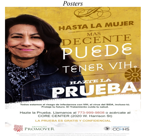
Figure 5: Social Marketing

A print campaign, including posters, palm cards and small hand flyers, designed to promote testing and reduce stigma emerged specifically aimed at reaching everyday working class, Mexican immigrant, community members and emphasized: 1) Everyone is at risk, 2) Testing is preventive care & being responsible to self and loved ones and, 3) free confidential testing at CORE (see figure 5).