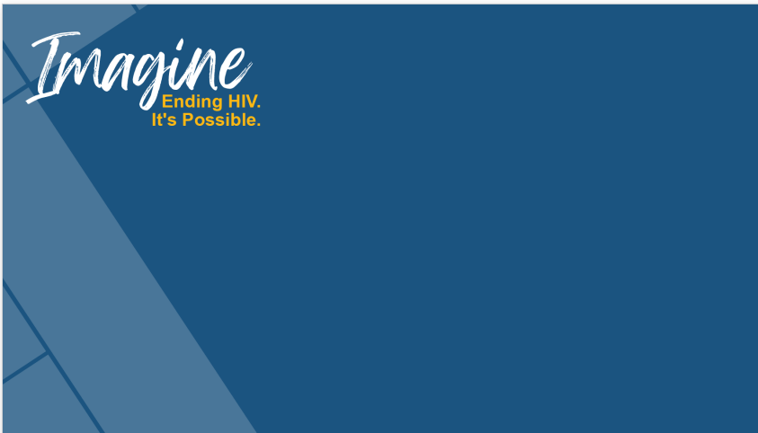
Imagine Campaign virtual background

Visit TargetHIV.org/Imagine for additional details about the Imagine Campaign and to download materials highlighted in this document.