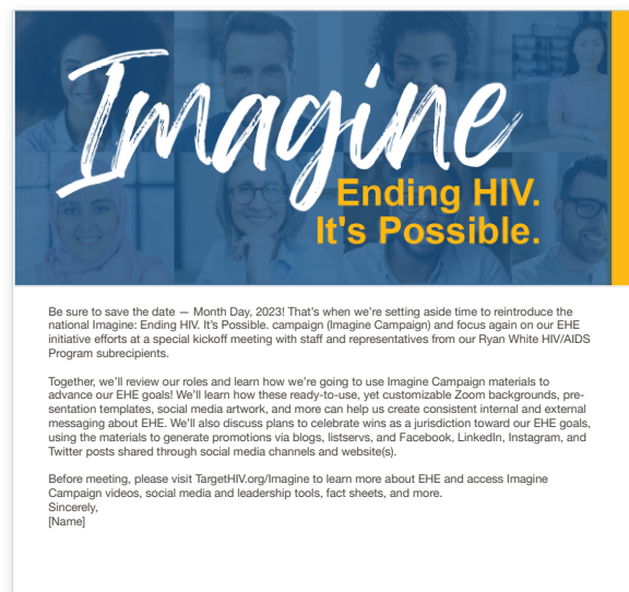
Sample email with Imagine Campaign header graphic.