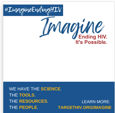
Photo template with Imagine Campaign logo