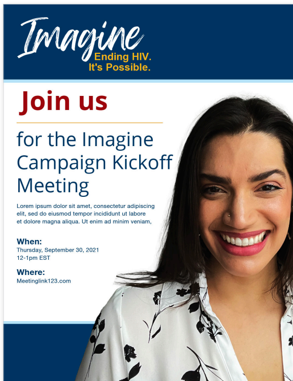
Printable document to be hung in lunch/break rooms with the date of kickoff meeting.

Once you have received buy-in from leadership and identified Imagine Campaign assets to use or tailor to support your EHE efforts, the next step is to inform the rest of the staff and schedule an Imagine Campaign kickoff. No kickoff is too big or too small. The primary purpose here is to spread the word to the rest of the staff in the best way you see fit. The communications channels are where your target audience receives information, such as weekly e-newsletters, regularly scheduled provider or quality improvement meetings, or a lunch and learn session.