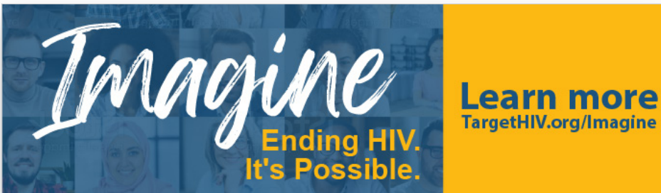
Imagine Email signature

CAI prepared this document under the TAP-in Project (Cooperative Agreement Award # U69HA33964), which is supported by the Health Resources and Services Administration (HRSA) of the U.S. Department of Health and Human Services (HHS) with 0% financed with non-governmental sources. The contents are those of the authors and do not necessarily represent the official views of, nor an endorsement by, HRSA, HHS, or the U.S. Government.